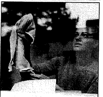
Learn more about reporting household worker income by reading Household Workers on the website.