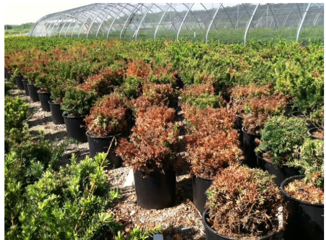
Fig. 4: Phytophthora root rot of yews in an eastern Kansas nursery

In landscapes and native stands, pine wilt, wetwood or bleeding canker of Siberian elm and walnut, and Dutch Elm disease of American elm are currently active.