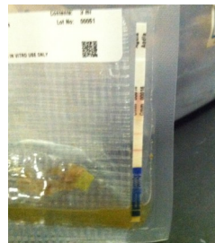
Figure 1 and 2: Goss's wilt leaf stage on corn leaves (Nuseed) and positive reaction to the bacterial causal agent (pink bands on test strip) J. Appel.

In soybeans, diseases have been impacted by the heat with foliar disease at a minimum. Sudden death syndrome and soybean cyst nematode were noted during inspections of breeding nurseries along with low levels of viruses. Last week, charcoal rot was observed in Cherokee County.