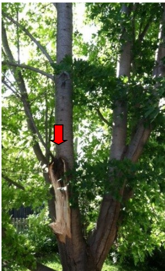
Fig. 3: Maple damage from wind