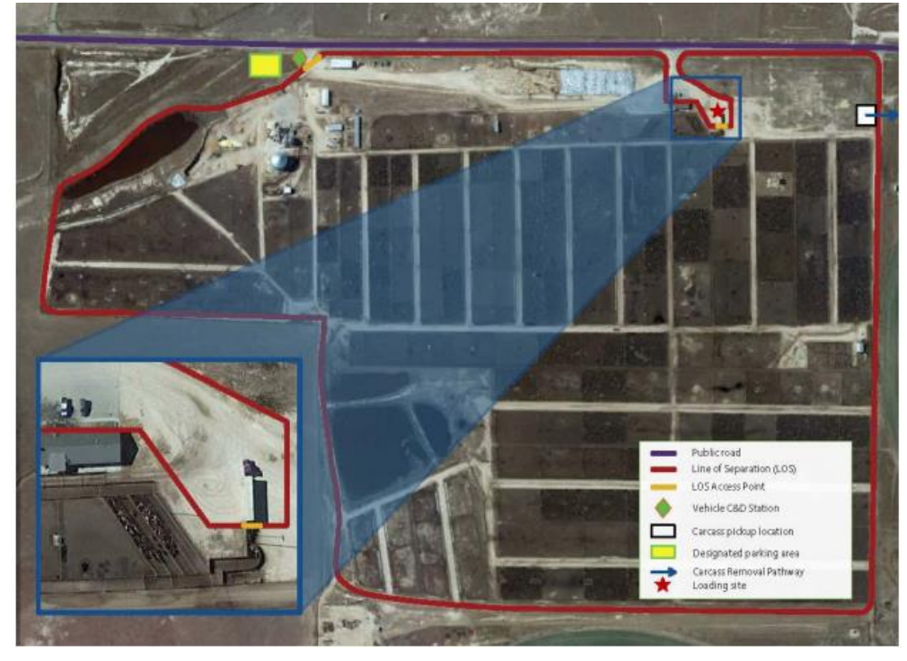
Figure E-2: Aerial view of operation with LOS indicated