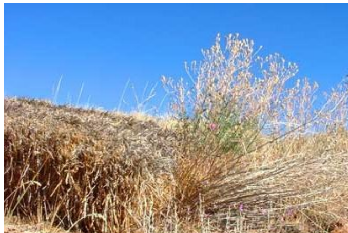
Spotted knapweed growing from a contaminated bale of straw.

You will be charged for the inspection, including travel time for the inspector, a fee for the bale tags required for identifying the certified bales and an optional charge for Transit Certificates if your buyer requires them.