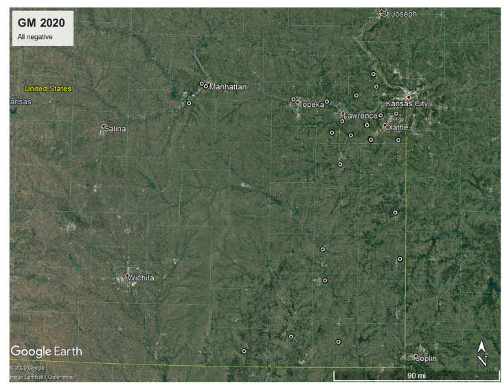
Figure 2. 2020 trapping for gypsy moth.

sole vector for Geosmithia morbida , the fungal disease agent that is responsible for thousand cankers disease of walnut. 50 species-specific pheromone baited Lindgren funnel traps were setup in northcentral Kansas.