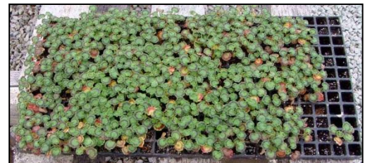
Geraniums with damping off, uneven growth and non-uniform color. Would your workers recognize a problem?