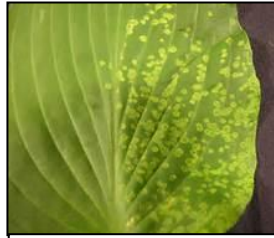
Hosta leaf with cucumber mosaic viral spotting. Transmitted with sap or by aphids.