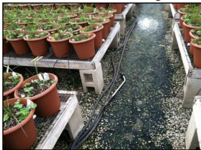
Poor sanitation practices

location without checking for diseases or insects? Are you willing to throw sick plants out cutting your losses and to save the crop? There are many things to consider, but cleanliness in any form cannot be overemphasized. Procedures such as washing hands and filling in puddles of water with gravel can pay huge dividends in getting plants actively growing to fend off disease. Hand wipes can be used in greenhouses for cleaning door knobs and cutting knives that may have plant sap that can carry viruses or fungal spores.