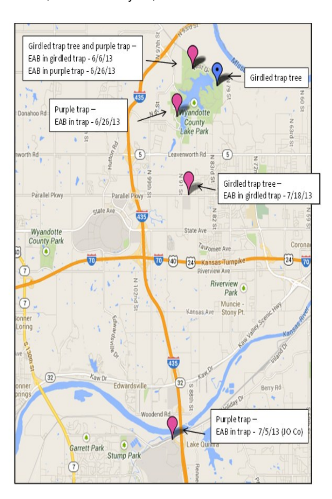
Map of positive EAB finds 2013

EAB larvae were found in all 3 Wyandotte county trees when they were cut down and the bark peeled, Adult beetles were found on 2 Wyandotte county tree, trapped in the Tanglefoot band. The adults were collected on June 19, 2013 and July 18, 2013.