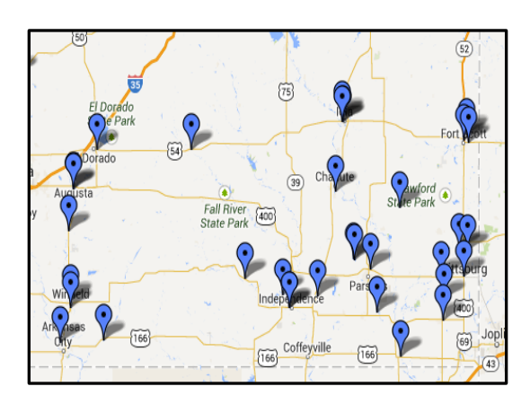
2013 Farmbill WTB trap locations set in 2013