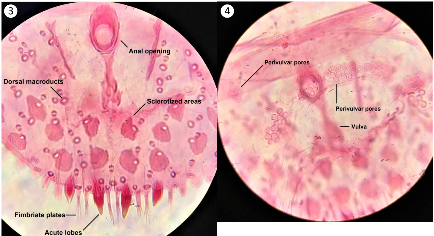
Figures 3–4. JMS slide mounts showing distinctive pygidium anatomy x1,000. (3) Dorsal. (4) Ventral.

economic losses in the U.S. as of 1990, and $2 billion (40%) is thought to be attributable to armored scales alone (Kosztarab 1990; Miller & Davidson 2005). A major reason for this is the large number of adventive invasive armored scales. Of the 1,019 species of scale insects in North America, 225 are adventive, 75% of which are pests compared to 8% of native scales being pestiferous. Most adventive species are from the Palearctic and polyphagous, feeding on many different plants. Interestingly, scale insects have an unexplained propensity to invade North America, representing 13% of the ~2,000 species of adventive insects, despite representing <1% of the total insect fauna of the U.S. (Miller et al. 2005; Wheeler & Hoebeke 2009).