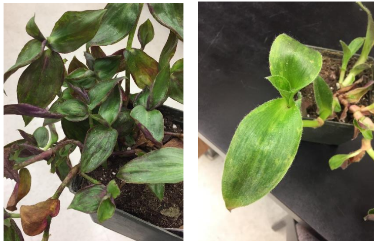
Figure 1: Two varieties of Wandering Jew were found to be affected. They showed symptoms of distortion, mosaic, and mottling of the leaves.

Potyriviruses are a genus of plant pathogenic viruses spread non-persistently by aphids; the insects can only transmit them to healthy plants for a very short time (minutes to a few hours) after feeding from an infected plant. They comprise at least 147 viruses, currently the largest genus of plant pathogenic viruses (~30% of known plant pathogenic viruses), and can affect hundreds of hosts. Some have very narrow host ranges, and others can affect up to 30 plant families. The most common symptom of a potyvirus is a mosaic of light and dark colors on leaves, typically on younger leaves.