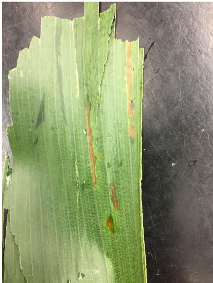
Fig. 2: Brown lesions with uneven edges characteristic of bacterial leaf streak in corn.