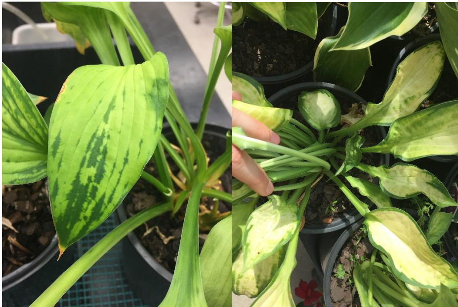
Fig. 4: Plants infected with Hosta Virus x show mottling and ink bleeding symptoms.

This summer saw an outbreak of Hosta Virus X occur at a retail box store across Eastern and Central Kansas. These plants were grown in Oklahoma and shipped to Kansas. This is the same virus that was found across several nurseries last year and is a very common virus within the Hosta trade. Its only host is Hosta; it does not spread to other species of plants. It is spread mechanically, by transmission of infected sap from contaminated tools or hands. The most common symptoms are “ink bleeding” of color in the leaves and leaf mottling and distortion (Fig. 4). There is no cure for this disease, nor is there a chemical that can be applied. The best methods of control are to watch newly planted Hosta plants for early signs of disease and remove any diseased plants. Do not compost the plants but throw them directly in the trash. When using tools such as clippers or shovels, sterilize between plants and after use.