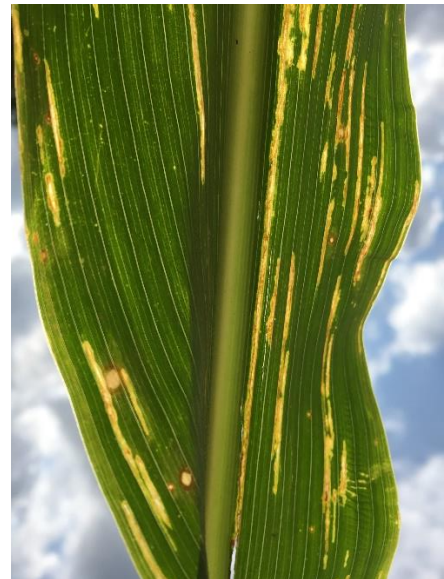
Fig. 3: When backlit, the brown lesions appear translucent yellow.