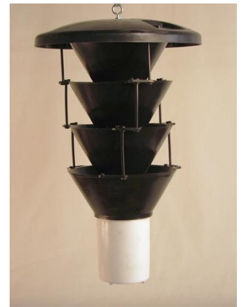
Map below: Not all sites can be seen because of the proximity of neighboring sites.

Currently, states to the west of Kansas have had TCD reports and three states in the eastern US. Those states include Tennessee, Virginia, and Pennsylvania.