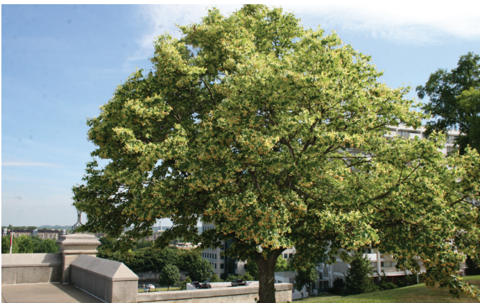
Figure 10. Do not apply pesticides to flowering trees such as linden ( Tilia spp.) that are attractive to pollinators.