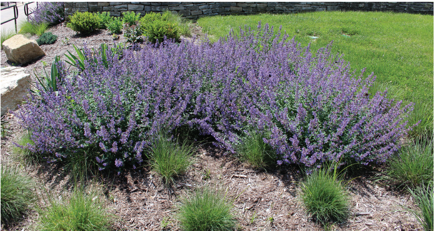
Figure 9. Do not apply pesticides to flowering plants such as sage ( Salvia spp.) that are attractive to pollinators.