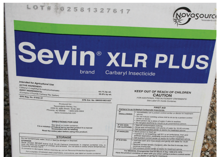
Figure 3. XLR formulation of Sevin (carbaryl).

Pesticides not only can kill bees directly but can negatively affect foraging behavior, reproduction, memory and learning ability, overwintering success, pollination, colony interaction and colony vigor. These indirect effects can be even more detrimental to the health of the colony. For example, when workers encounter a sublethal concentration (dose)