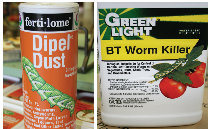
Figure 11. Insecticide products containing Bacillus thuringiensis subsp. kurstaki as the active ingredient.