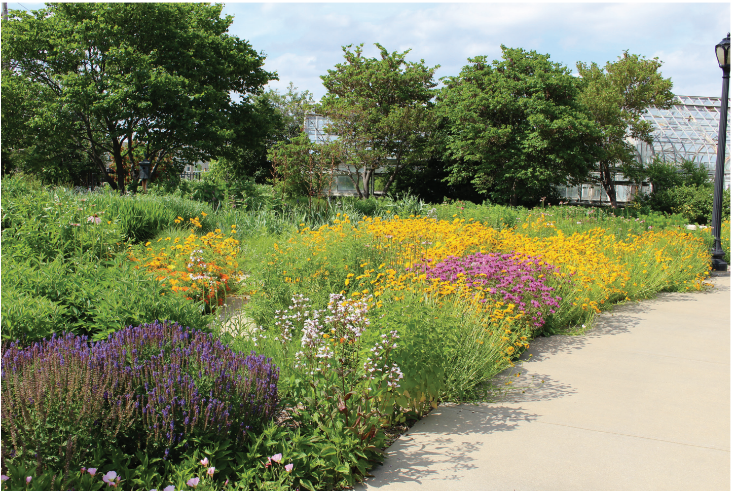
Figure 4. Flowering plants that are attractive to bees.

of an insecticide and do not return to the hive with pollen and nectar, bees starve and the colony declines.