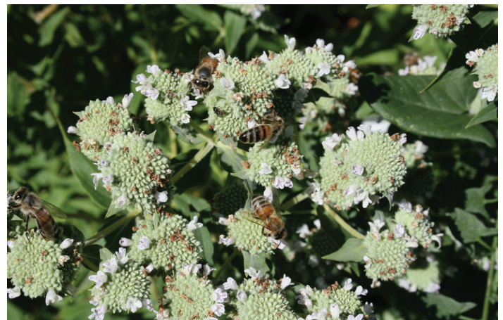
Figure 2. Honey bees foraging on a flowering plant.