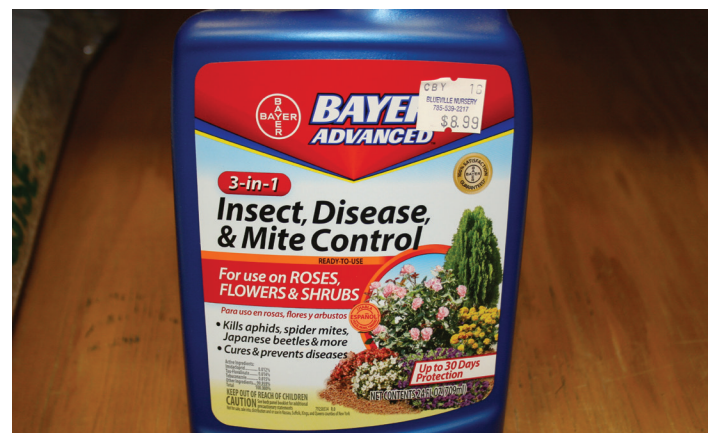
Figure 8. Pesticide premixture containing an insecticide, a miticide, and a fungicide.

Miticides, fungicides and herbicides. Various miticides used to manage varroa mite, Varroa destructor , populations in honey bee colonies can have direct or indirect effects on honey bee queen longevity and reproduction. Fungicides used to control fungal diseases of vegetable and fruit crops can harm bees directly or indirectly. A fungicide commonly detected in beehives is chlorothalonil, sold under the trade name Daconil or Bravo.