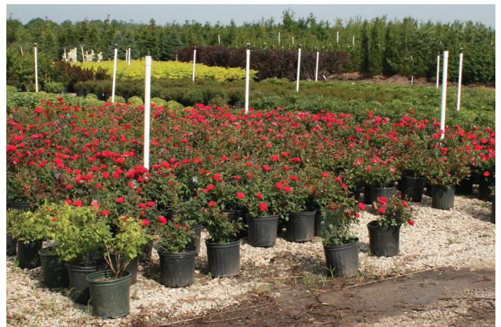
Figure 7. Example of container nursery production system.

Cyano-group neonicotinoids such as acetamiprid are less harmful to bees, mainly because the active ingredient is metabolized by bees. In addition, the active ingredient targets a different site in the central nervous system. In general, acetamiprid and any metabolites produced are less harmful to bees than other neonicotinoids because the active ingredient is metabolized rapidly. Acetamiprid has