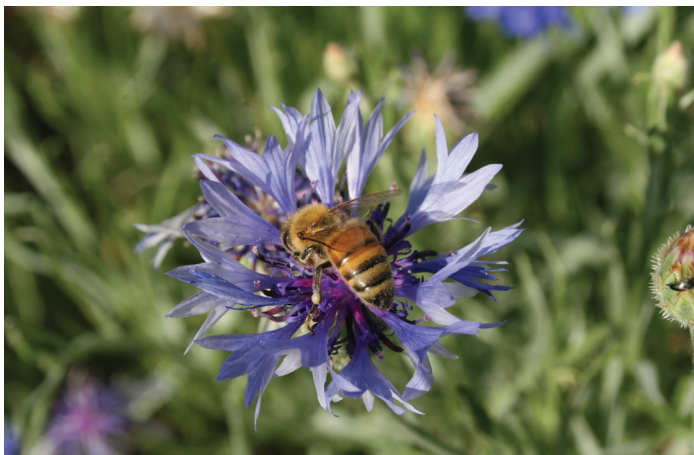
Figure 1. Honey bee, Apis mellifera , feeding on a flower.