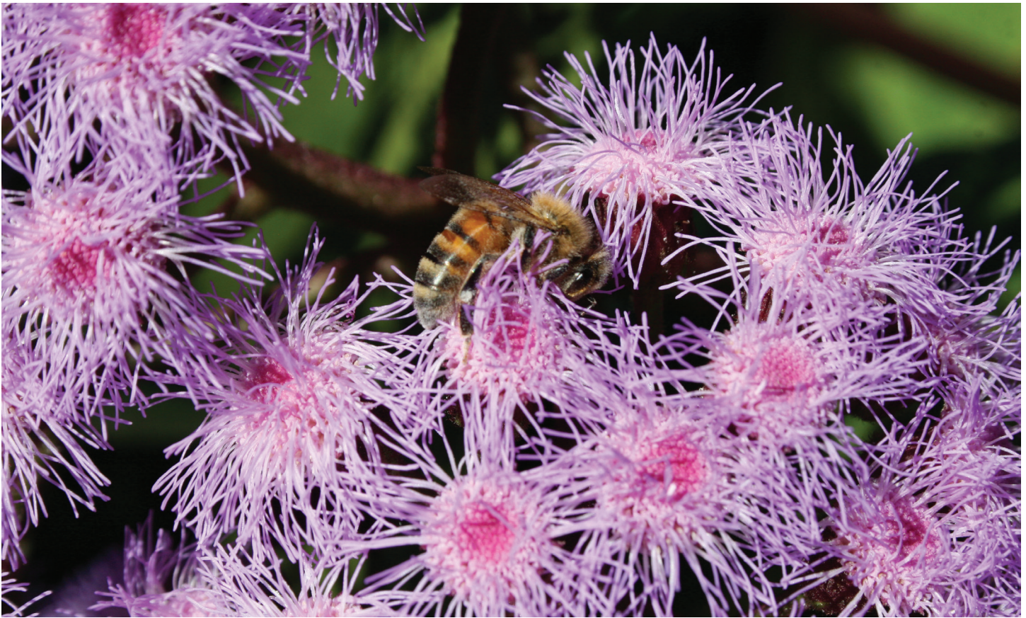
Figure 6. Honey bee ( Apis mellifera ) feeding on an aster flower.