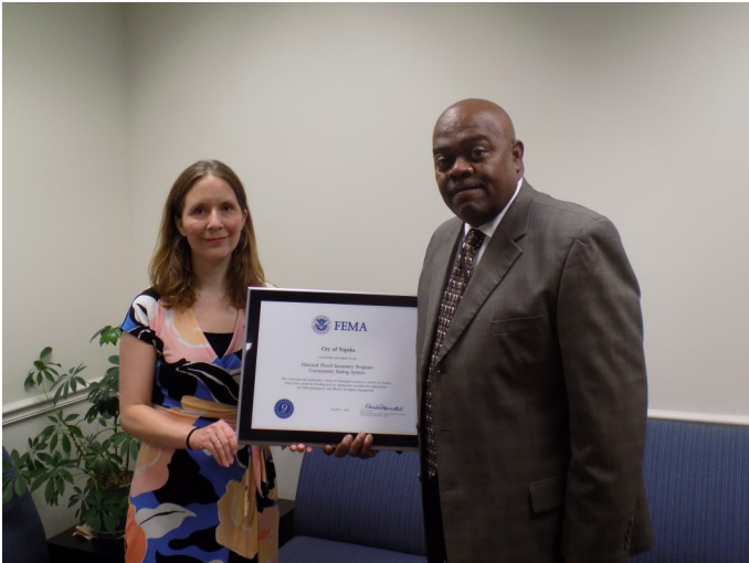
City of Topeka accepts CRS plaque

The CRS program operates on a system in which communities earn points for various activities such as keeping the floodplain as open space, adopting a mitigation plan, education and outreach, and adopting higher regulatory standards into their floodplain management ordinance. KDA-DWR can assist communities with many of these activities in order to earn points, and many times what a community is