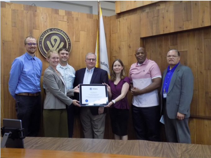
Unified Government of Wyandotte County and Kansas City accept CRS plaque

already doing is enough to enter CRS at a Class 9. A minimum of 500 points is required for each class level, and there is a 5% discount on insurance premiums as you move up in class.