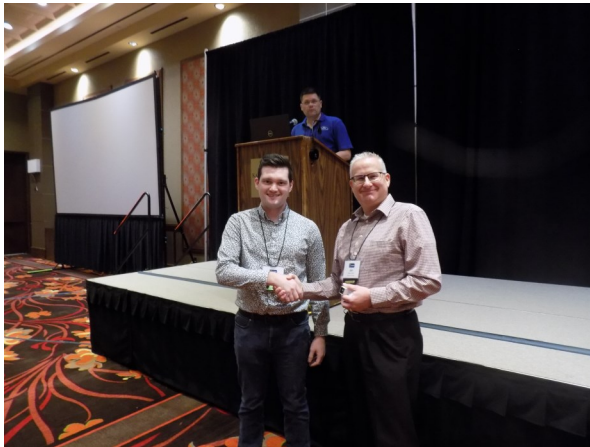
Successful exam takers receive their CFM pins