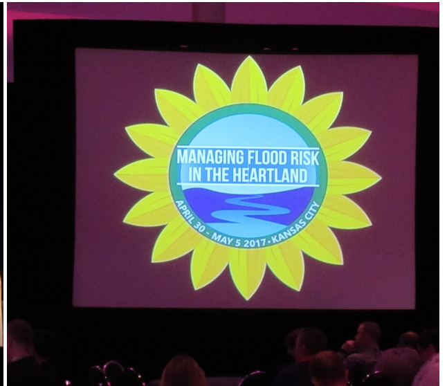
2017 Conference Logo.