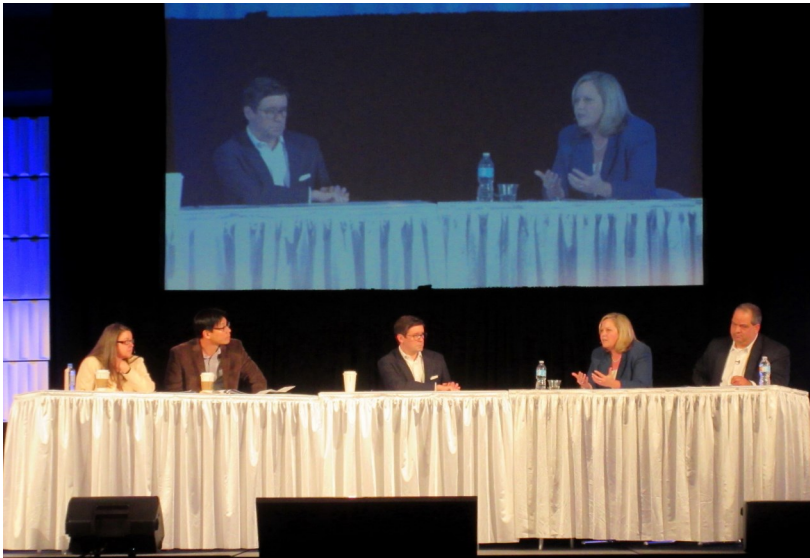
Federal Emergency Management Agency Town Hall.