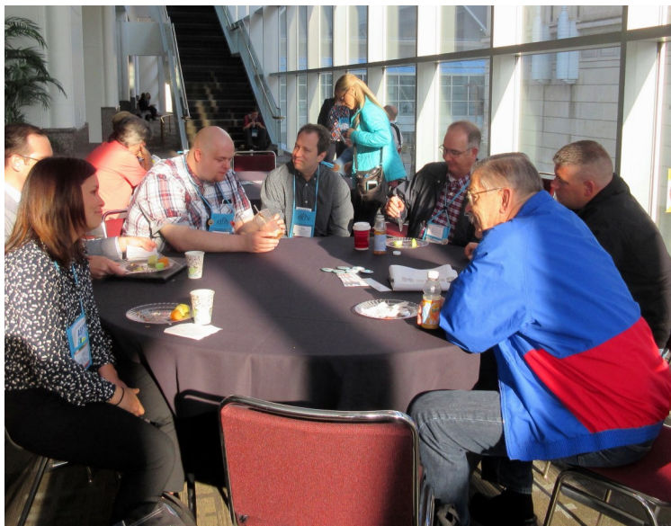
Kansans at breakfast before Plenary.