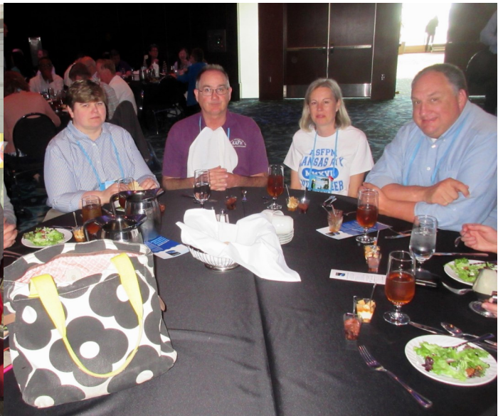
Attending the Awards Luncheon