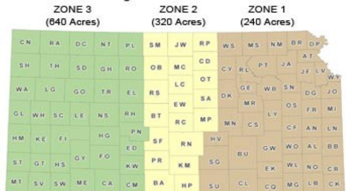
Minimum Drainage Area To Constitute A Stream

For more information on Water Structures permits, call 785-296-2855, or visit www.ksda.gov/structures/ .