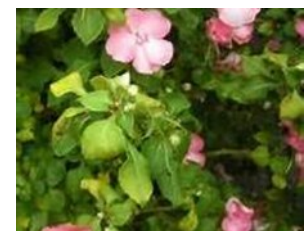
Early yellowing from DM. DM can be mistaken with damping off. Greenhouse Grower.