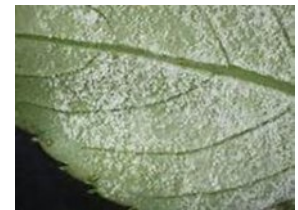
Mildew growth on underside of leaf

Fungicide programs should begin immediately. Infected plants should be bagged up and disposed of. Bag up the plants on the spot than drag them through the greenhouse to control disease dispersal. New Guinea Impatiens and SunPatiens are resistant.